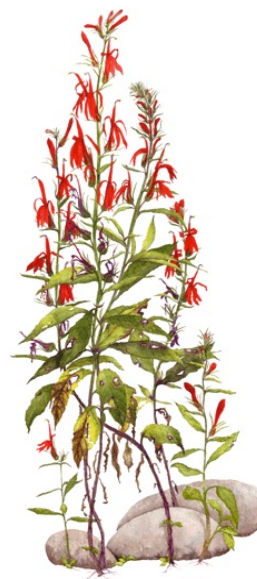
Cardinal Flowers.